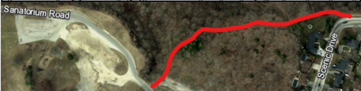
Outline of Trail Between Scenic and Sanatorium to be Redeveloped